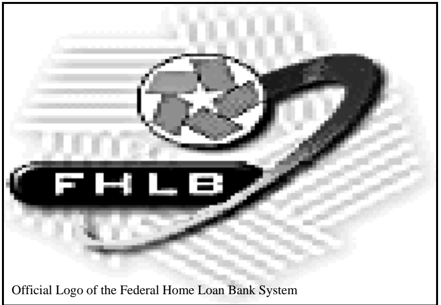
Official Logo of the Federal Home Loan Bank System